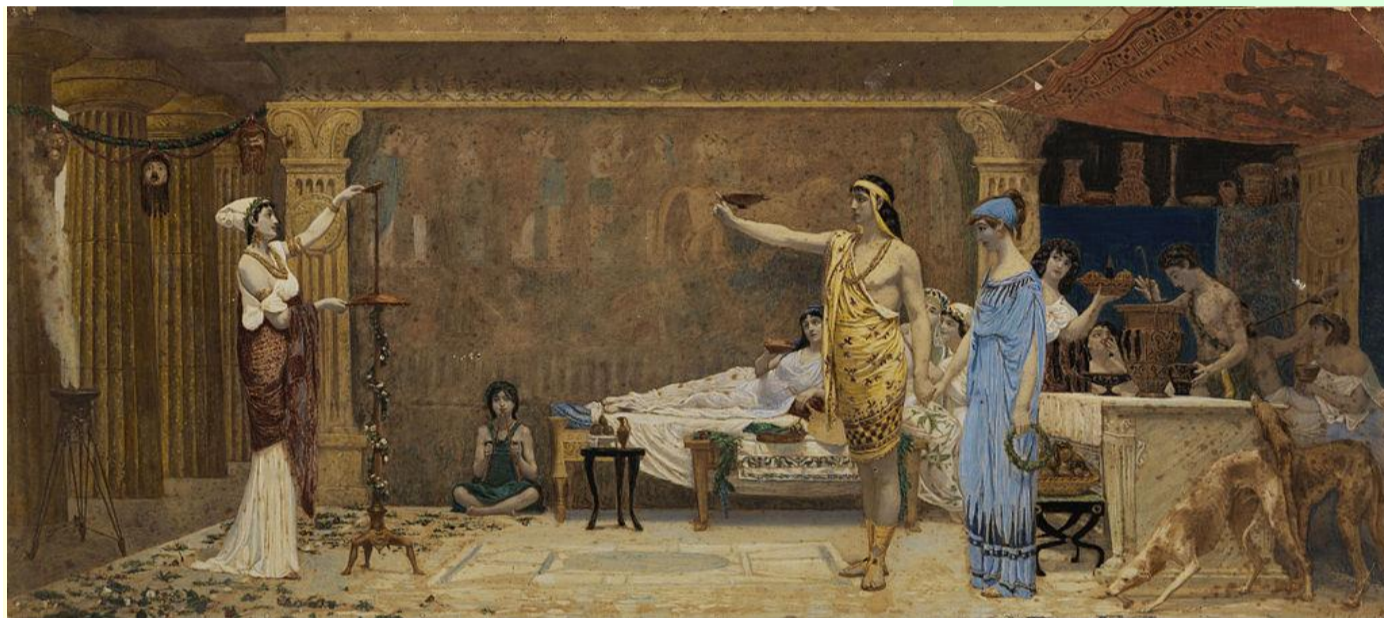
A picture of Kottabos playing, by Anatolio Scifoni, 19th century.