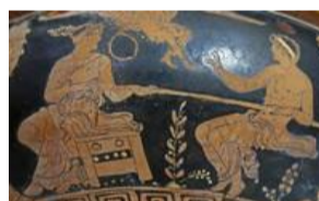
Apulian lekane, ca 380 BC.

Among the players, we may see sometimes some divinity like Aphrodite or Eros, sometimes a satyr. Players often held a stick with their left hand while playing, perhaps in order to count points. What were the stakes? Considering the characters depicted, love was certainly present. Who will get a fortunate fate ?