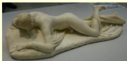
Hermaphrodite, Louvre-Lens ,