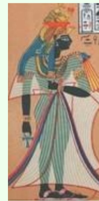
Queen Ahmose Nefertari

Gaston Maspero, a Frenchman who was in charge of Egyptian antiquities at that time, went to Luxor in order to investigate the strange appearance of precious objects on the market..