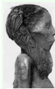
Ahmose Nefertari's mummy

Tuthmosis III, Ramses II, Amenophis I, Ahmose, and his wife Queen Ahmose-Nefertari, a prominent political figure from the beginning of the 18th dynasty, and among the most revered by the people.