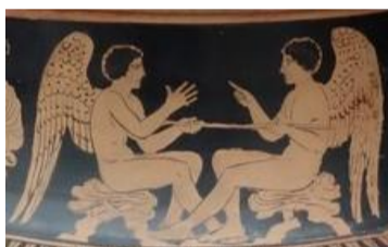
Apulian crater, ca 420 BC.